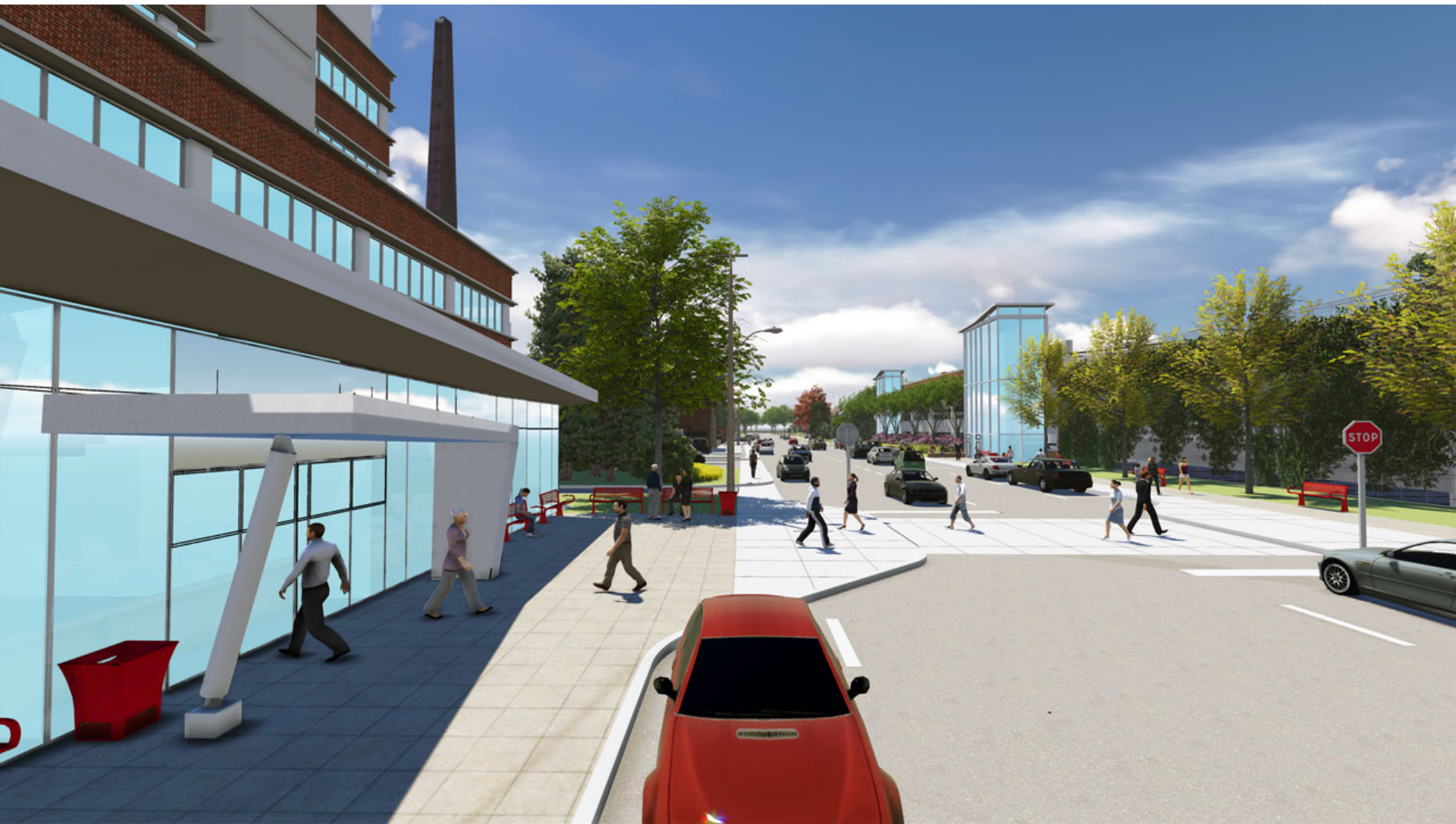
PEDESTRIAN CROSSING BETWEEN HEART INSTITUTE & PARKING GARAGE