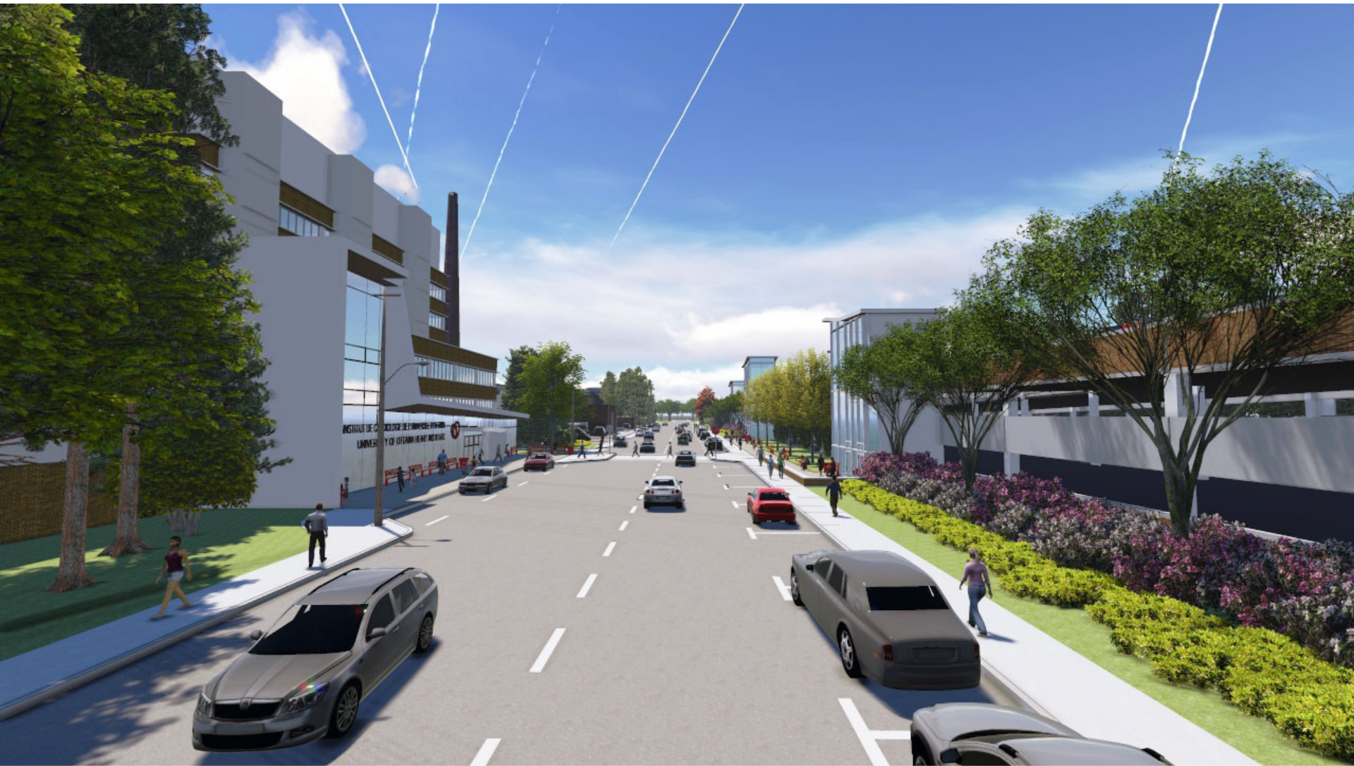
RUSKIN STREET LOOKING WEST