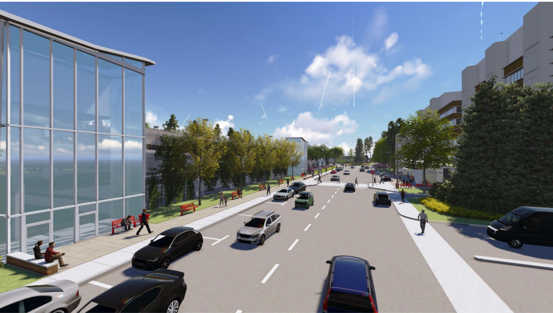
RUSKIN STREET LOOKING EAST