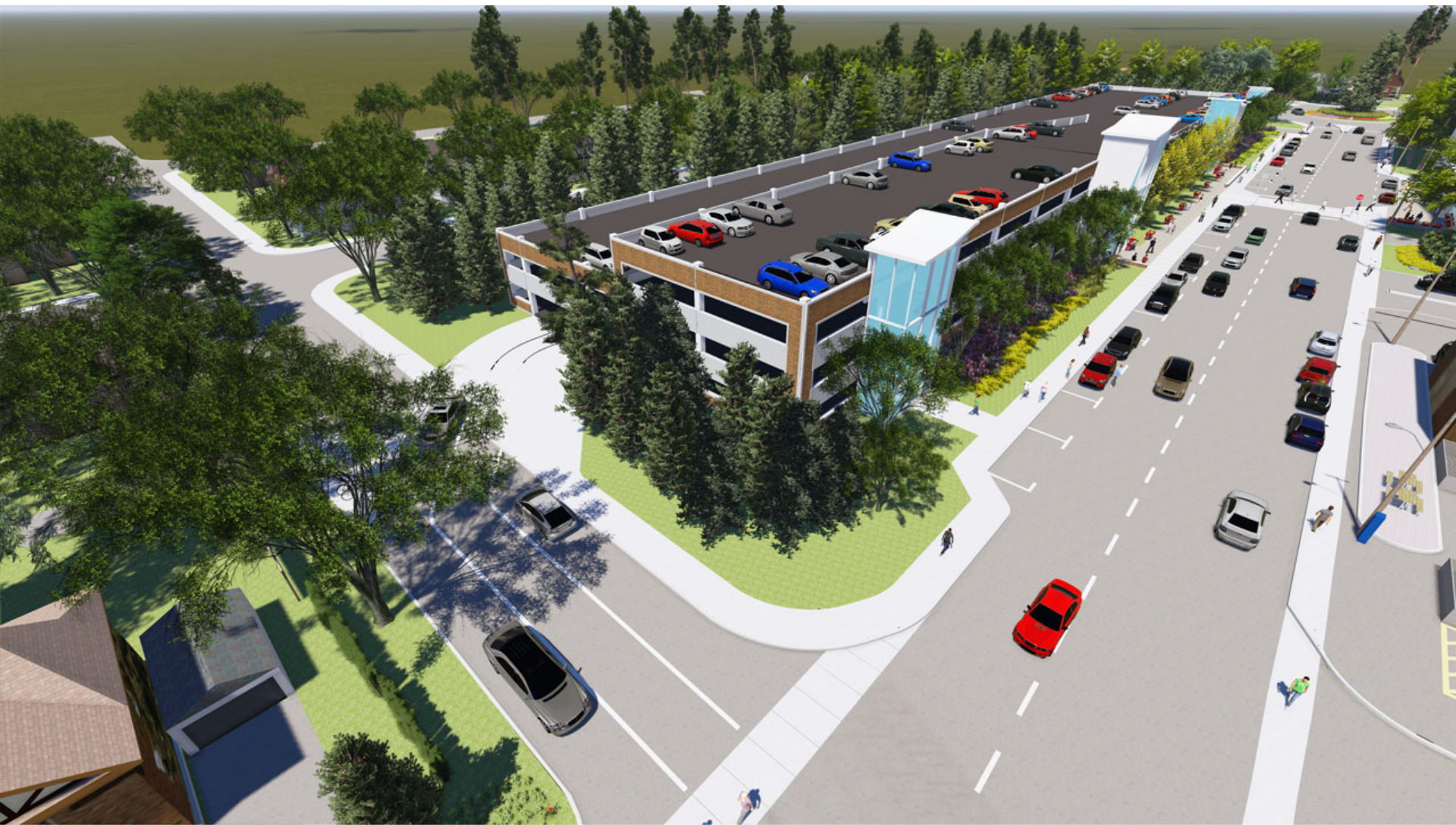
HEART INSTITUTE & PARKING GARAGE - AERIAL VIEW LOOKING EAST ON RUSKIN STREET