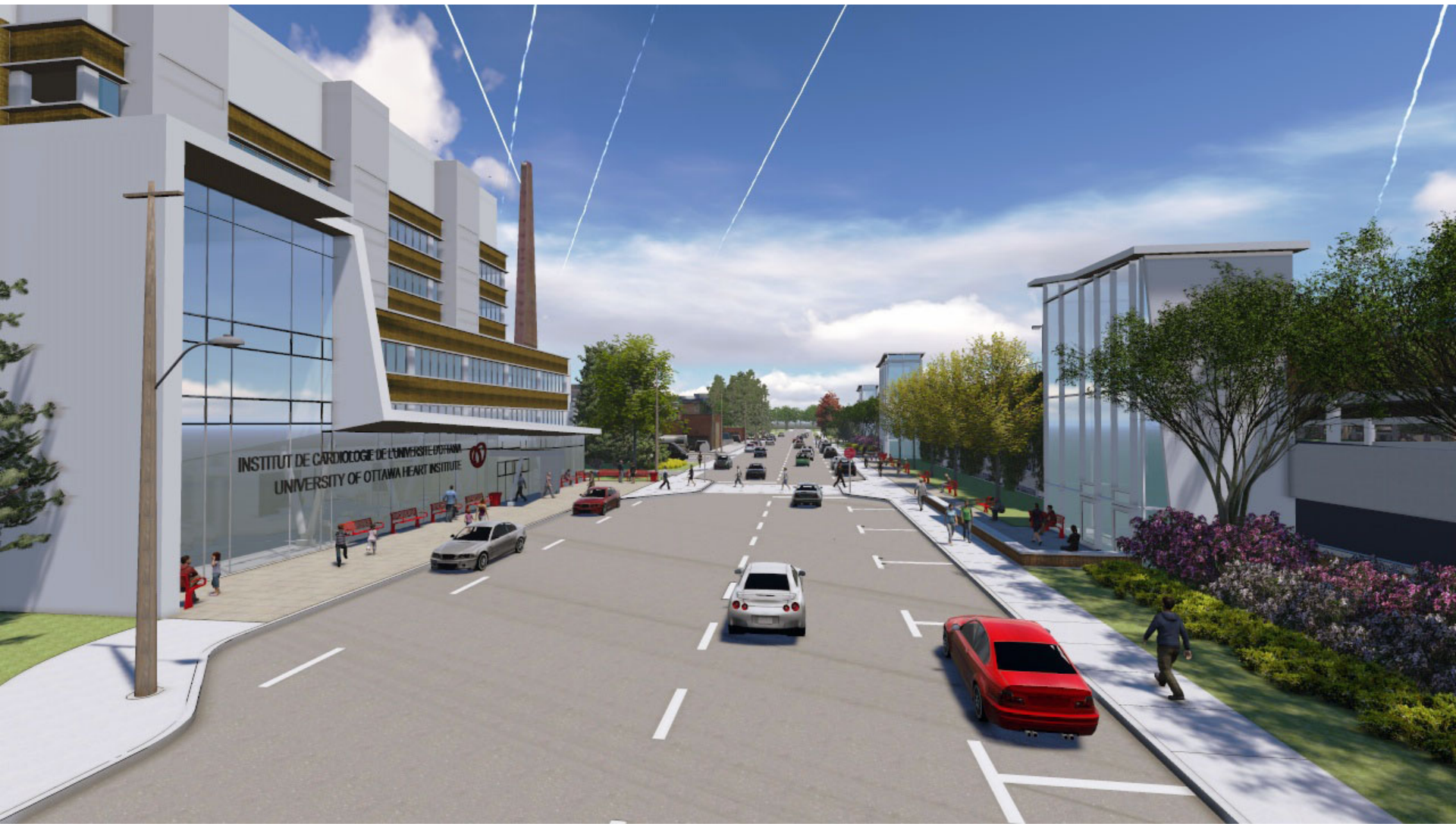
RUSKIN STREET LOOKING WEST